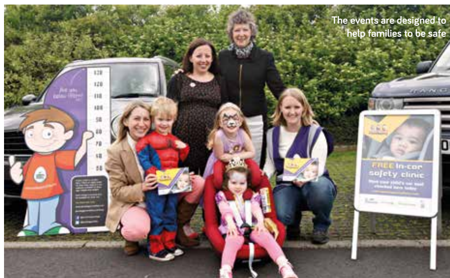
The events are designed to help families to be safe

Initiative will help ensure youngsters' safety on the move